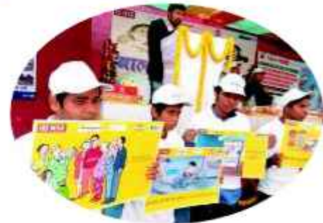
Visually impaired children participating In Balmela on 31st January 2019 in Dumka