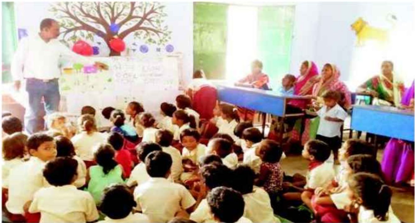
School girls playing board game last class activity