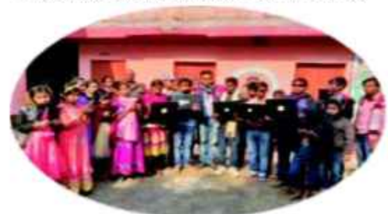
Training on ICT based skill development to the visually impaired children participating At DDRCC, Dumka